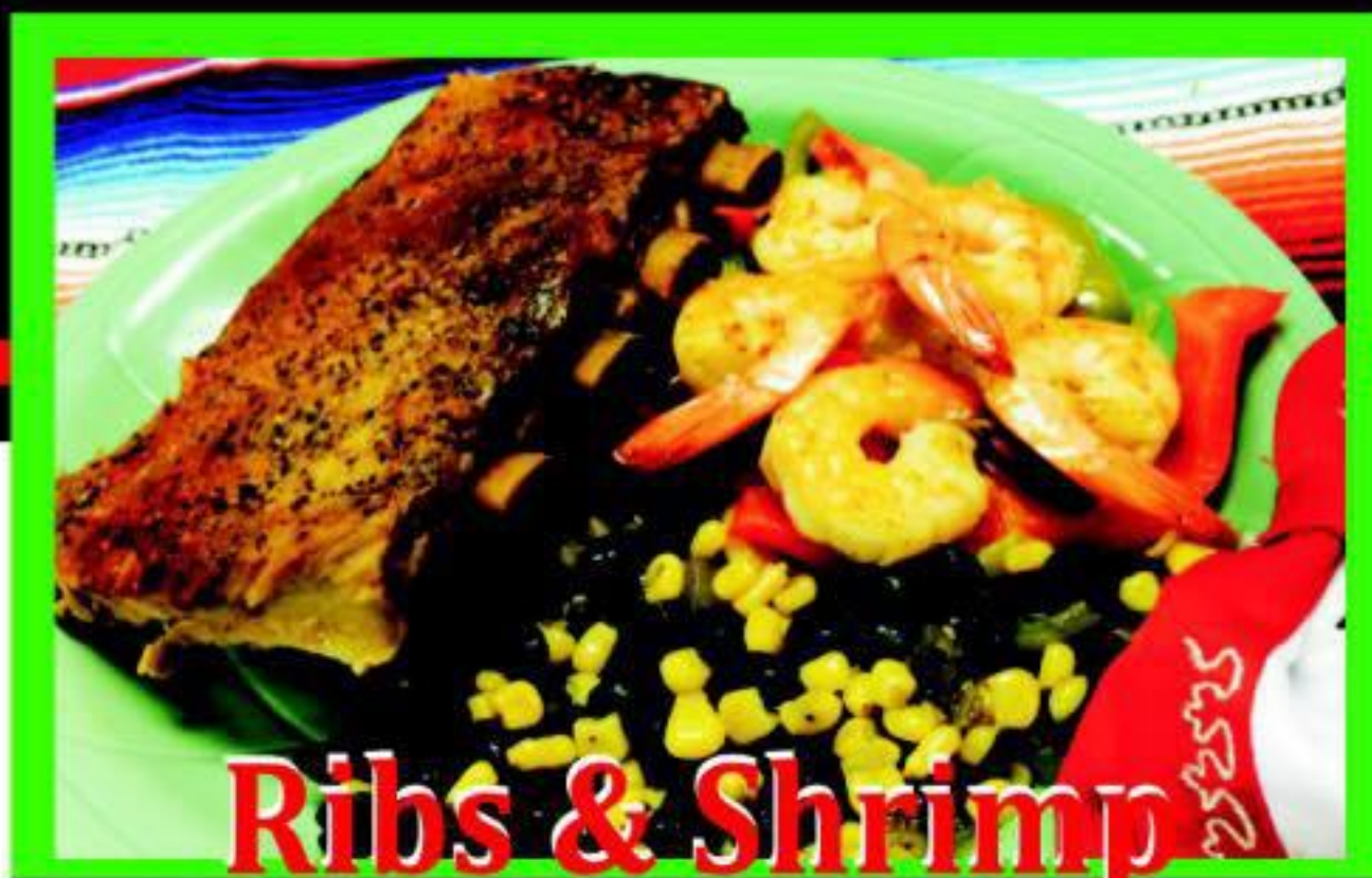
Ribs & Shrimp